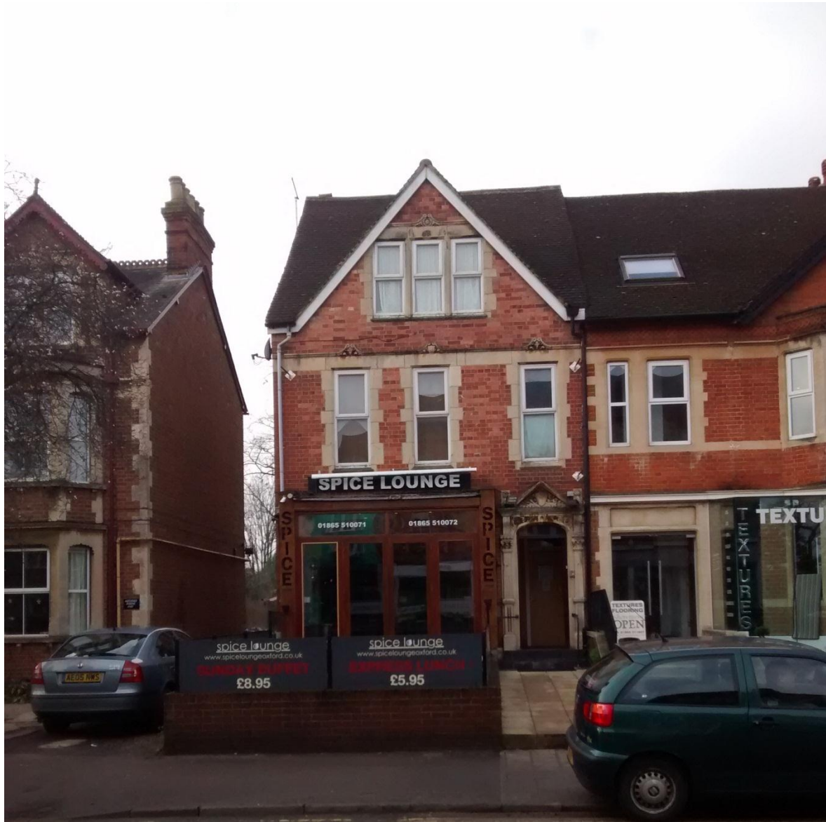
Front elevation facing Banbury Road